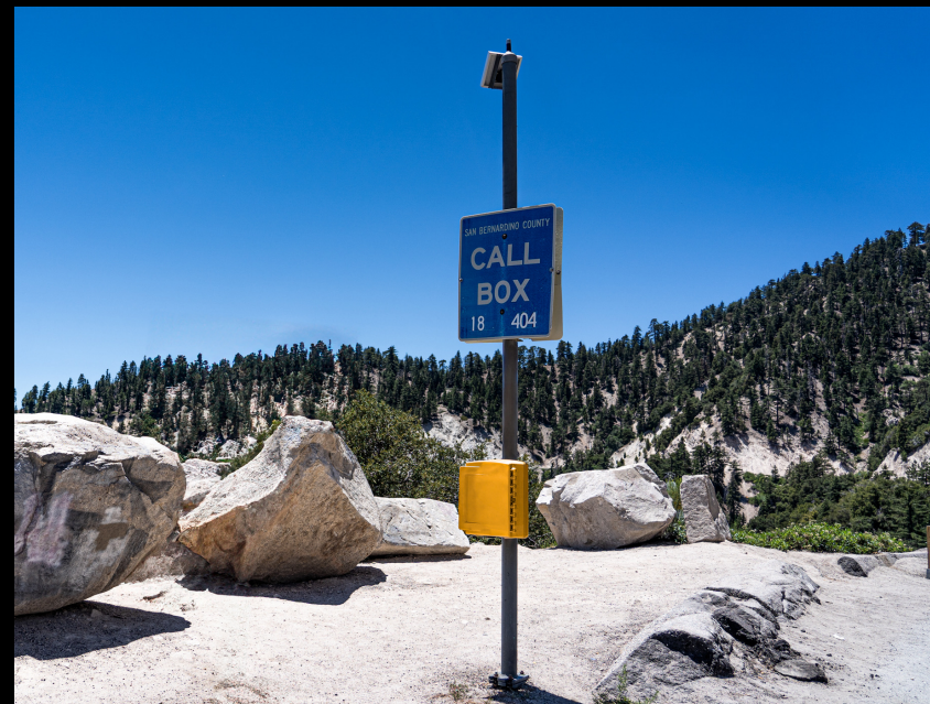
K1 Call Box