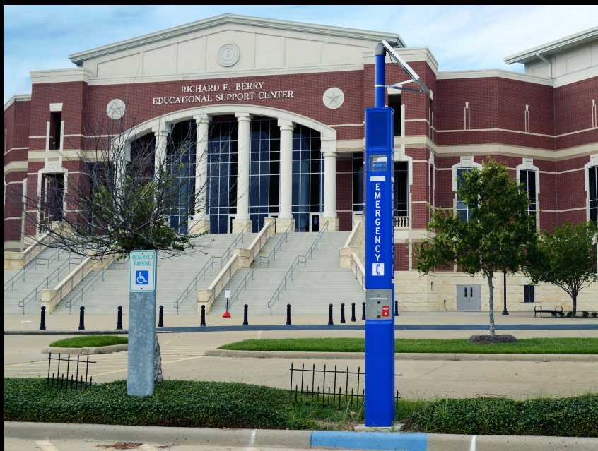
K1 Blue Light Tower