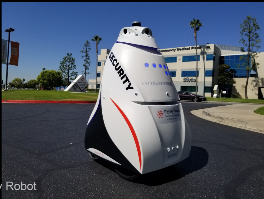
K5 Autonomous Security Robot